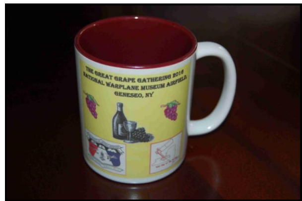
The BBQ Door Prize