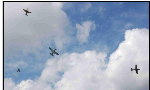
The WWII Airplanes.

P-30 had eight fliers and FAC Embryo had seven, which is an indicator that folks were taking advantage of the opportunity to fly.